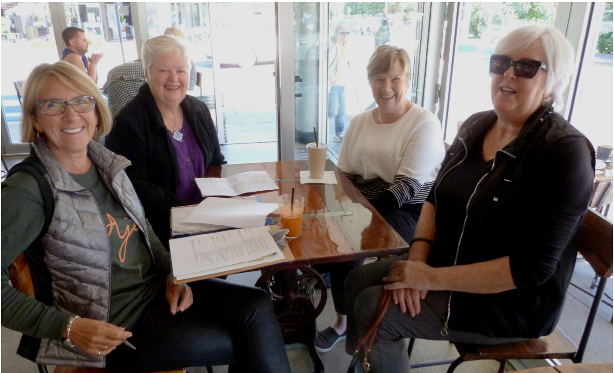
Social Committee hard at work to make fun for the Lions, at Mojo's at Cotton Tree